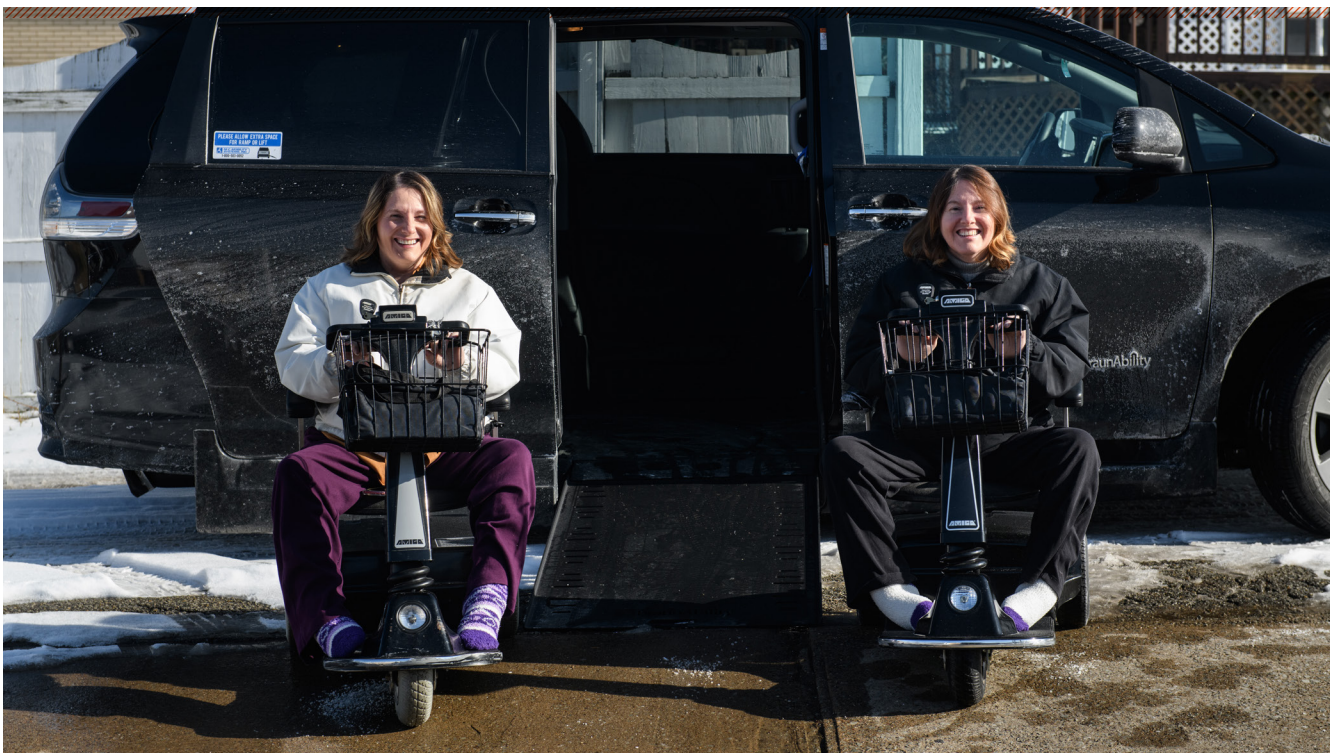
Joy and Jill used a combination of monies saved in their ABLE accounts and their Special Needs Trusts to purchase their adapted van.

The chart on the following pages will help you understand and compare ABLE accounts and Special Needs Trusts, as you determine how each option might work for you.